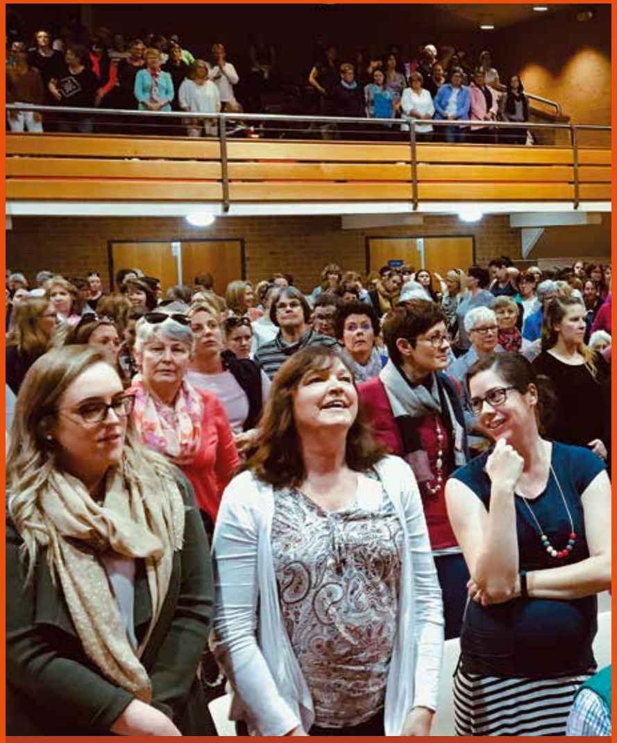
The crowd at the New Life conference last year.

up the challenges God put before him. Such great courage, and great faith comes with our discipleship in and by our great God.