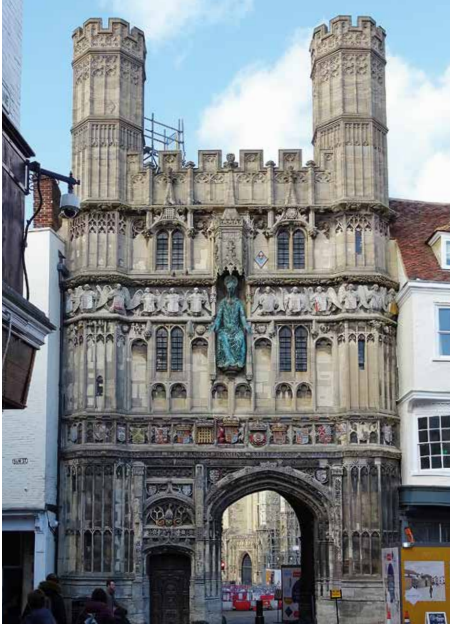
Christ Church Gate, Canterbury.

If we return to the apostolic Grace of 2 Corinthians, it is the fellowship of the Holy Spirit that binds us together in Christ, not the historical ties of the British Empire. This was the view of the bishops who gathered at Lambeth in 1920, who issued an Encyclical