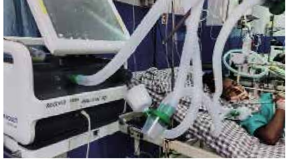
Donations from Anglicans in the North West have helped supply vital equipment to Indian hospitals.

The Doctor leading the Covid response for