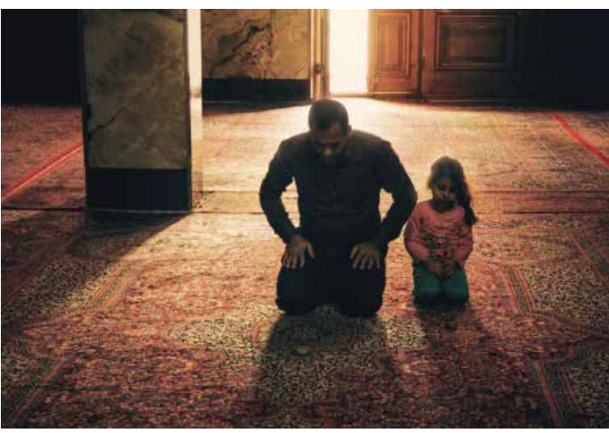
Through CMS, the gospel goes to old and young.