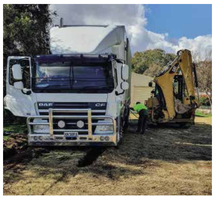
A bogged removal truck is just one of the joys of country ministry.

had finally taken its toll. Tenterfield parish had gone into survival mode. I believed that the best course of action for a travelling chaplain was a ministry of compassion and encouragement. That would involve a lot of visiting. Unfortunately, the whole state went into lockdown.