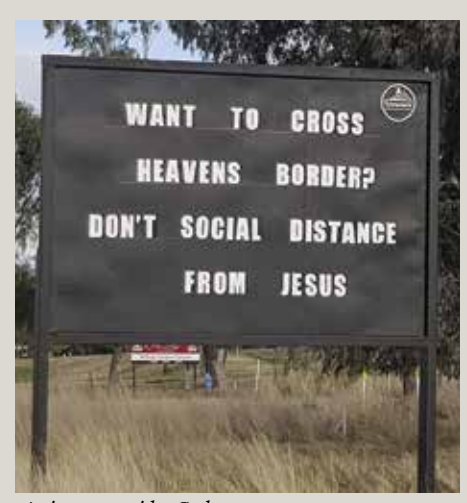
A sign to consider God

Humanly speaking, there have been many things against us this past year, but despite